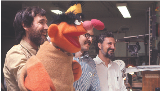
A scene from the documentary "Street Gang: How We Got to Sesame Street."